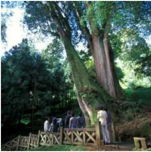
The Giant Trees in the park